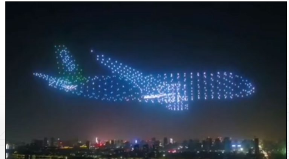
Drone show: multi-agent deployment